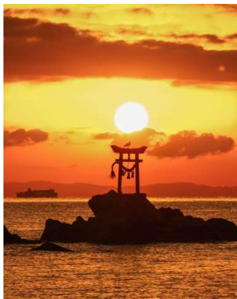
GRAND PRIZE juka sato