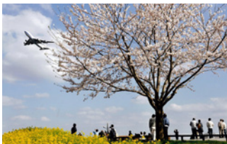
Narita City Sakura-no Yama Park

“Sustainable NRT 2050” presents the Narita International Airport Corporation’s strategy for addressing climate change up to 2050. Its goal is to achieve net zero CO 2 emissions by that year. Initiatives include solar power generation, the carbon neutralization of buildings, the purchase of renewable energy, LED aviation lights, and reduced vehicle pollution. Sustainability initiatives at international airports contribute significantly to reducing the environmental impact associated with business events.