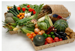
Vegetables grown in Chiba Prefecture

The cuisine of Chiba Prefecture makes use of fresh ingredients available from the ocean and the countryside. Thick-rolled sushi, a typical local dish, was one of the “top 100 rural culinary dishes” selected by the Ministry of Agriculture, Forestry, and Fisheries. This has been served at international conferences including a G20 meeting held at Makuhari Messe. In the city of Chiba, 47 restaurants (as of the end of January 2023) are registered as Chiba Tsukutabe Suggested Restaurants. Observing the ethos of “local production and local consumption,” they make active use of Chiba agricultural and livestock products.