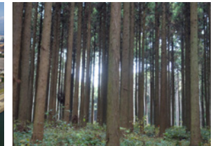
Forest in Sanmu City