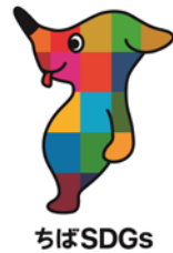
Chiba Prefecture’s mascot, CHI-BA+KUN

In 2021, Chiba Prefecture established the Chiba SDGs Partner Registration System. This keeps track of companies and organizations promoting voluntary initiatives related to the environment, society, and the economy. Participants are required to set specific targets and their efforts are detailed on the prefectural government’s website. As of January 30, 2023, 1,614 organizations were registered on the scheme. Local financial and economic organizations that share the system’s goals have been brought together via the Chiba SDGs Promotion Network*. In February 2023, the network was awarded the Cabinet Office’s “Regional Revitalization SDGs Financial Award,” in recognition of its achievements in raising awareness, and bringing public and private sectors together.