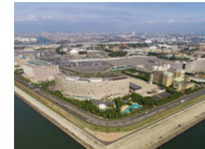
Resort hotels in Urayasu City

In 2022, Urayasu signed an agreement with Sanmu, a city in northeast Chiba with bountiful forest resources, covering the implementation of forest improvement in Sanmu. Urayasu will bear part of the cost, and will use the forest’s increased carbon dioxide absorption capability to offset Urayasu’s own emissions.